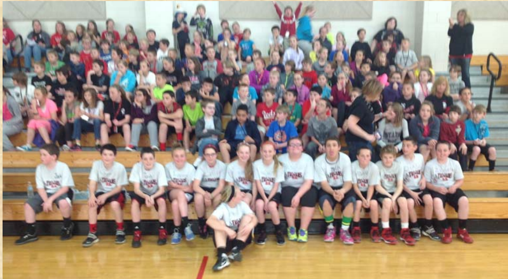
Student Basketball Team-6th Graders